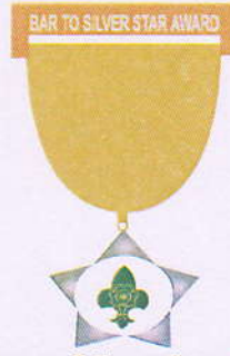
Bar to Silver Star Award