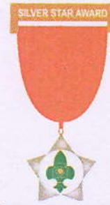
Silver Star Award

SUB.: RECOMMENDATIONS FOR AWARDS AND DECORATIONS OF BHARAT SCOUTS & GUIDES FOR THE YEAR 2017-18.