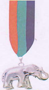
Silver Elephant Award

Circular No. : 84 / 2018 Dated : 19 th Sept. 2018